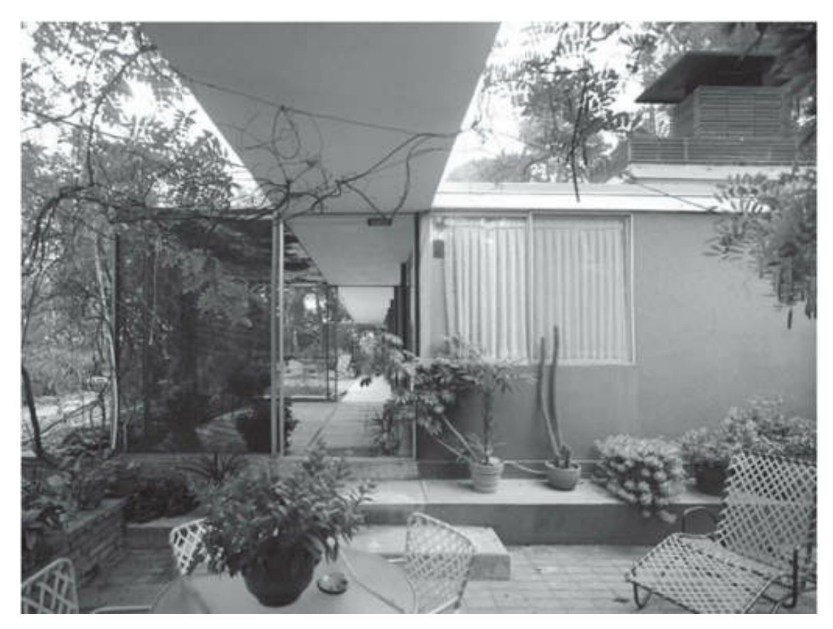
The Shulman House